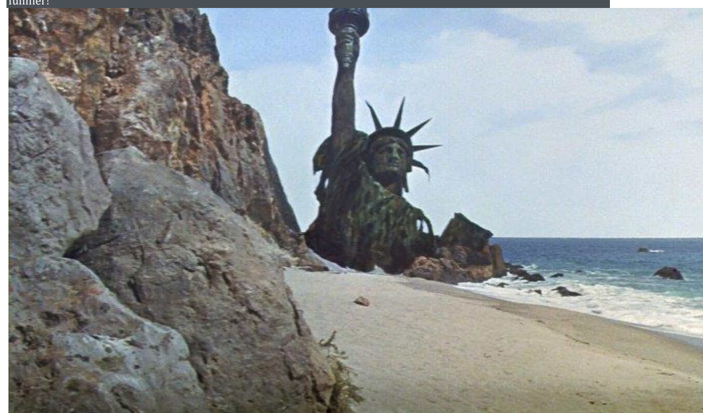
Unlike you, I welcome our future ape masters!

Do you know that scene from The Planet Of The Apes? "You blew it up - maniacs", I tell you it just keeps getting funnier!